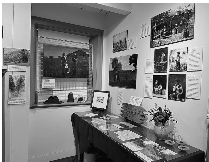
Below: Winslow Homer exhibit, Eagle's Nest section