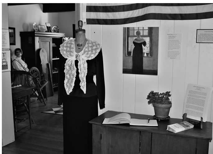
Top: Entry hall and permanent Dutch exhibit room